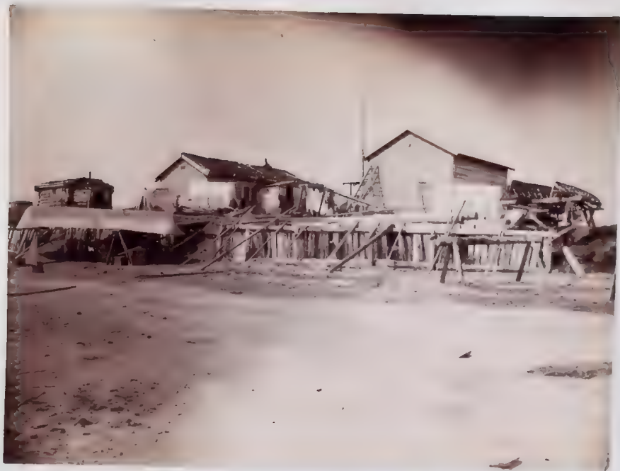
19. Vicinity of the proposed Moravian Mission Mamtrehlagamute Kuskokwim River.